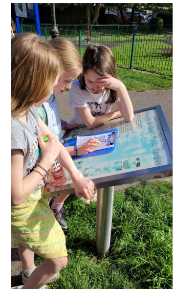
On the Murder Mystery walk in Alton