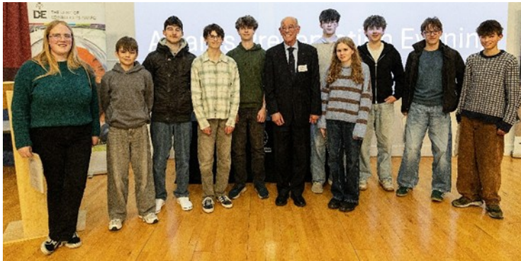
Our participants who received Certificates – 1 Bronze and 9 Silver

At the recent East Hampshire DofE Presentation Evening in Bordon, ten of our participants were present to receive their Certificates, with two more unable to attend.