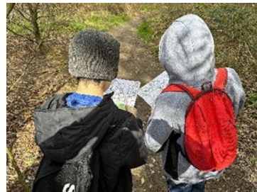
Studying the map