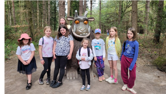
Our day out in Alice Holt Forest, following the 'Witch on the Broom' trail.