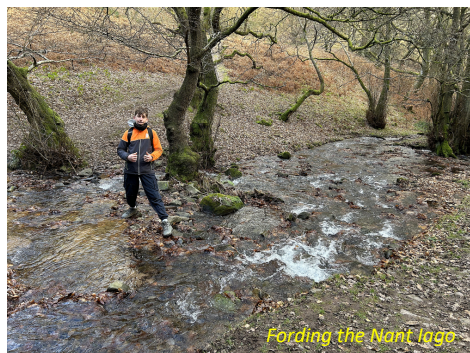
Fording the Nant Iago