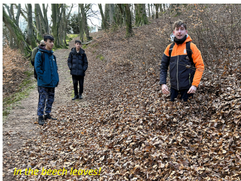
In the beech leaves!