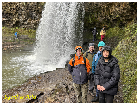
Sgwd yr Elra