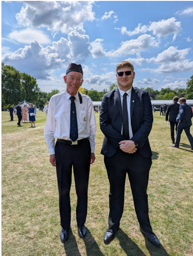
In the palace gardens