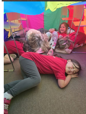
Fun in the parachute tent