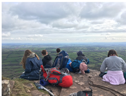
Enjoying the view, before the snow flurries