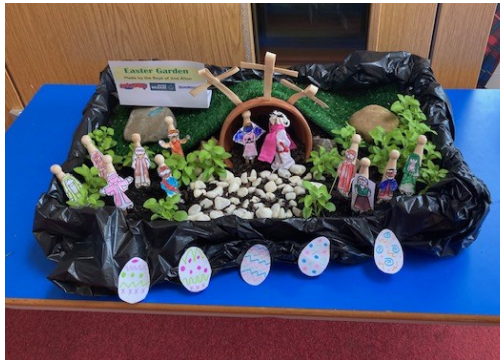
The Easter Garden made by the Junior boys