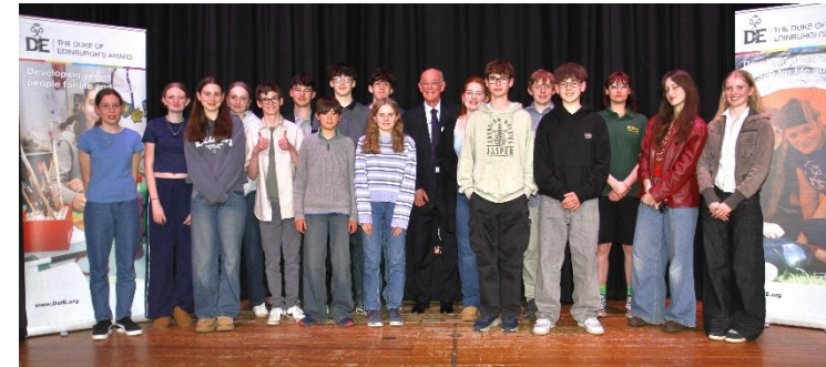
The DofE Achievers from our 2nd Alton group