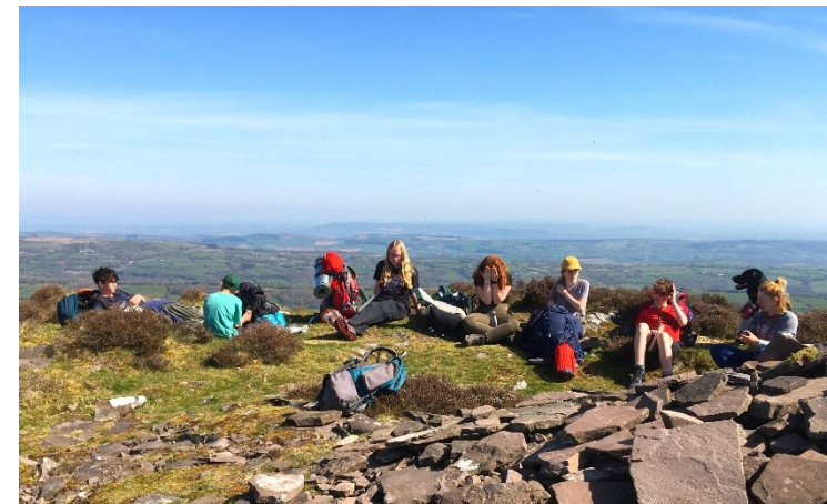
The first Silver group enjoying the sun at 2000 feet up

Two DofE Silver practice expeditions took place in the Forest of Dean and on the Welsh border hills. The first had glorious sunshine, while the second had rather mixed weather, with a whole day of rain, mist, wind and cold!