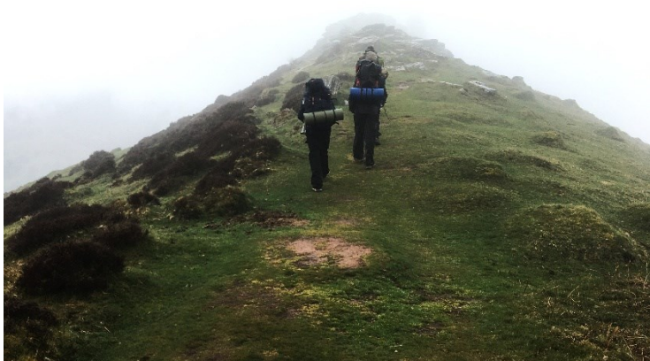
The following week's group disappearing into the mist – at the same place!

The Bronze group are going out on navigation practice on Hankley Common as this newsletter goes to print. Then the focus moves on to planning for everyone's assessed expeditions, over the summer and into the autumn.