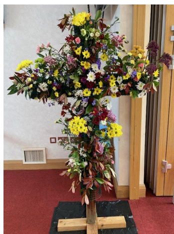
Our Easter Cross, beautifully decorated with flowers and foliage on Easter Sunday